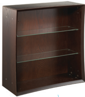
CD Qube Wenger.