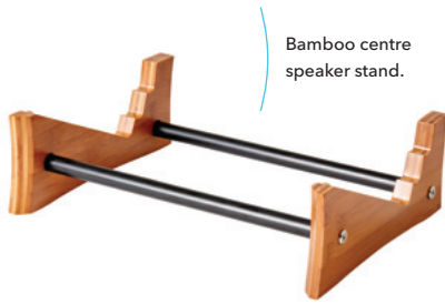
Bamboo centre speaker stand.