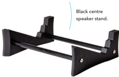
Black centre speaker stand.