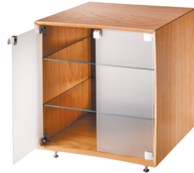
HIFI Qube Oak with Sandblast doors and adjustable feet.