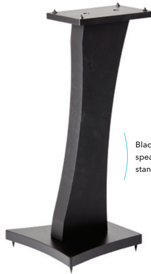
Black speaker stand.