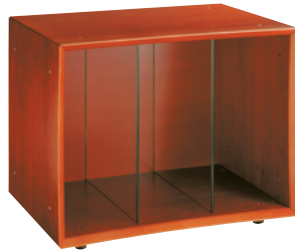
LP Qube Cherry.